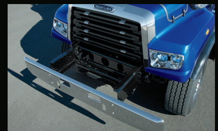
Tilt hood with radiator-mounted stationary grille and front frame extensions.