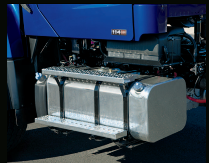
Under-cab storage for up to three batteries allows for clear back-of-cab packaging.