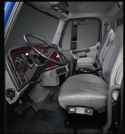
Ergonomically designed driver's area features an automotive-style dash, easy-to-read LED-backlit gauges and controls within easy reach.

FIND A TRUCK FOR YOUR BUSINESS AT FREIGHTLINERTRUCKS.COM/WORKSMART